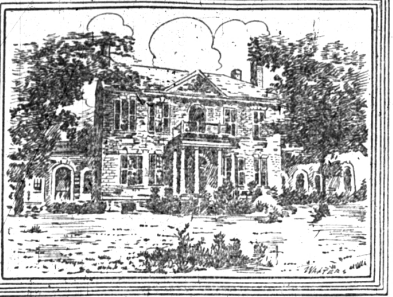
Woodland Mansion, Westmoreland County, Virginia, one of Washington's earliest homes.

At the age of 16 he was a good surveyor and at 19 he was an adjutant of one of the Virginia militia districts.