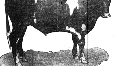
Steer sired by grade bull, after having been fed for six months. Daily gain, 1.54 lbs.

The farm is electrically lighted throughout, has its own water works and sewer system, and in fact, the sanitary arrangements are so perfect that they have been heartily commended by the state board of health.