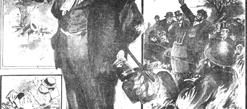
THE PERMANENT CHAIRMAN