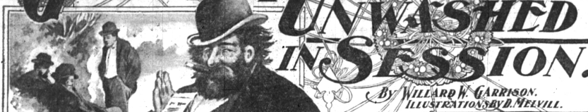
By WILLARD H. GARRISON. ILLUSTRATION BY E. HENNELL.

213 - Eight acre house and 100 feet front and 30 feet deep of the Woodstock estate... 214 - Village lots on Woodward avenue... 215 - Good comfortable, very old-fashioned house... 216 - One acre on Magalloway street... 217 - Eight-acre farm in White Lake township... 218 - Farm in the Township of Southfield... 219 - Village lots near the City of Birmingham... 220 - Farm of 60 acres on Section 1, Twp. 1 N., R. 2 E., S. 10 N.