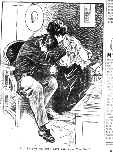
"Excuse Me, But I Love You, Love You, Bob."

prostrate my father's character and to understand how terrible this error is to him. Every morning of his life he spends an hour after breakfast with my dear mother, who is a cripple from old disease.