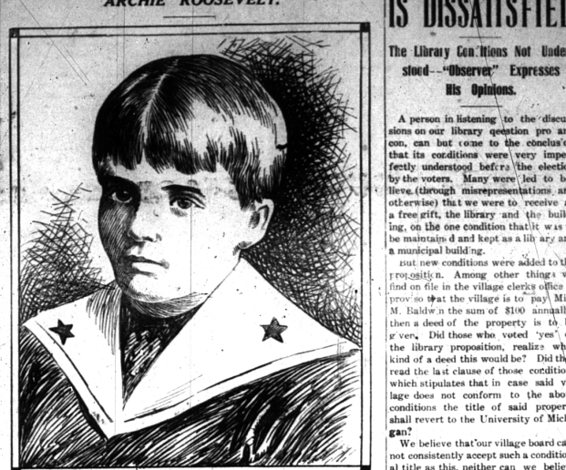
Son of the President, who has been very ill, but is now rapidly recovering from his attack of diphtheria.