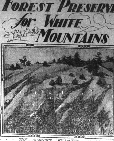
THE DENIRED HILLSIDES

HOLLISTER'S Rocky Mountain Tea Nugget... Golden Nuggets for Sallow People