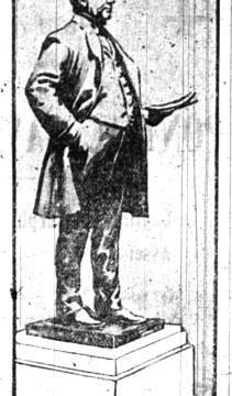
STATUE OF MCKINLEY, Unveiled by Mrs. Longworth at Columbus, Ohio.