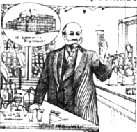
The Discoverer of Swamp-Root at Work in His Laboratory.

There is a disease prevailing in this country most dangerous because so deceptive. Many sudden deaths are caused by heart disease, pneumonia, heart failure or apoplexy arising from the result of kidney disease. If kidney trouble is allowed to advance the kidney poisoned blood will attack the vital organs of the kidney themselves, break down and waste away cell by cell. Then the richness of the blood—the albumen—breaks out and the sufferer has Bright's Disease, the worst form of kidney trouble. Dr. Kilmer's Swamp-Root, the new discoverer of 1913 is true specific for kidney, bladder and urinary troubles. It has cured thousands of apparently hopeless cases, after all other efforts have failed. At drug stores in city-centers and country towns, a sample bottle can be procured free by mail, also a book telling about Swamp-Root and its wonderful power. Address Dr. Kilmer & Co., Elmhurst, N. Y., and mention this paper.