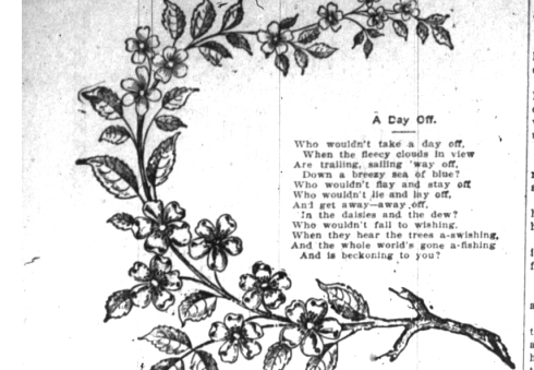
A Day Off. Who wouldn't take a day off. From the heavy clouds in view are training, sailing away. Down a breezy sea of blue? Who wouldn't stay and stay on? Who wouldn't be and be off? Who wouldn't be and be off? And the whole world's gone a-fishing. And he beckoning to you?

Every physician of large practice has had the experience of being called on to attend women who imagined that they were in the last stages of some dire female malady when upon examination the fact was revealed that obstructed physiology of the stomach or bowels was the whole cause of the trouble.