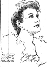
She evokes Patti, Nilsson, or Josephine.

One of the newspapers devoted to the feminine interest has been organizing a competition relative to the nomination of celebrated French women to an 'Academy of Lady Immortals'.