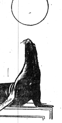
"A large ball is tossed in the air and caught, spinning, on the nose of the seal-baller."

and by courtesy of the management, facilities were granted to the writer to interview the trainer of the troupe.