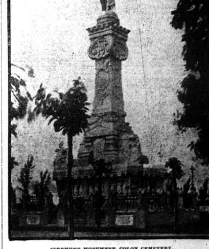
FIREMEN'S MONUMENT, COLON CEMETERY. (Finest piece of marble work of its kind in the world. Cost, $10,000.)

From a photograph shown here with one may gain an idea of the brunette type of beauty for which the "Pearl of the Antilles" is famous. Note the large dark eyes and the Spanish cast of countenance.