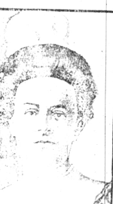
Otto von GUERICKE