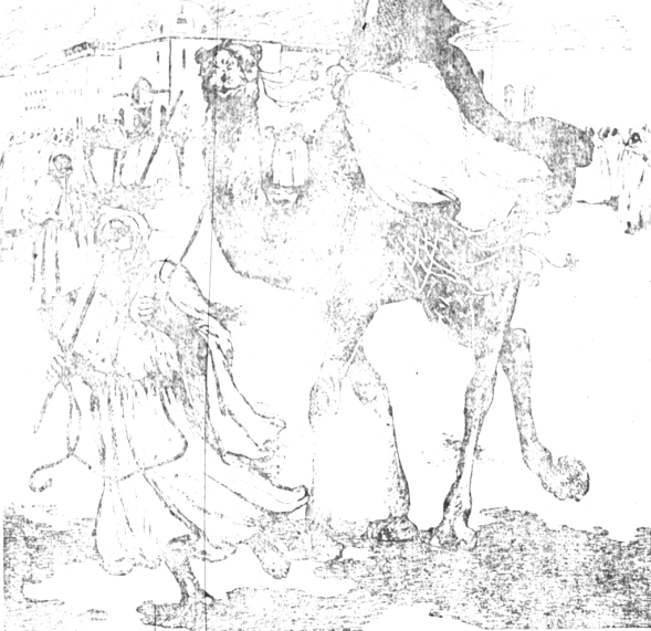
In the Streets of Paris