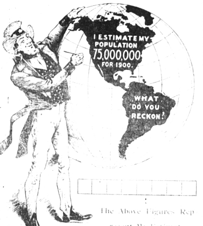
The Above Figures Represent My Estimate.

among those making the nearest guess or estimate of the population of the United States and Territories, not including Hawaii, Guam, Porto Rico or the Philippines, as shown by the official census of 1900, which will be taken in June next.